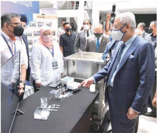
Ismail Sabri (right) stops by at an exhibition booth after the launch of the PPVN and the MGVI. — Bernama photo

He also expressed confidence that Malaysia could reduce its dependence on vaccine-producing countries when it strengthened the country's health security. — Bernama